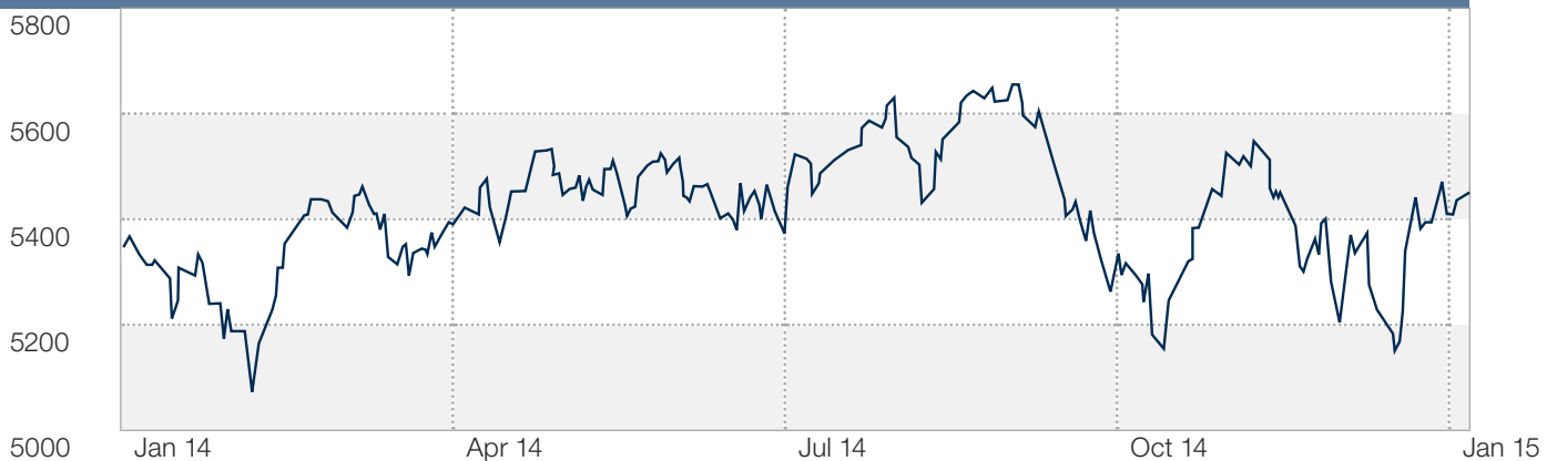
Australian stock market (S&P/ASX 200)